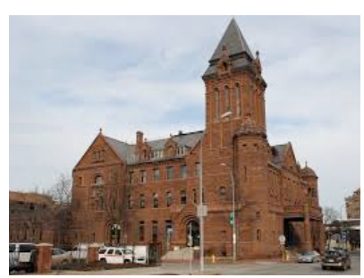
Rochester City Hall

Leader: We adore You, O Christ, and we praise You, People: Because by your Death and Resurrection You have saved us.