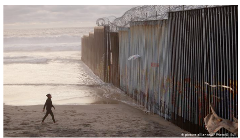
Border Wall near San Diego

Leader: We adore You, O Christ, and we praise You, People: Because by your Death and Resurrection You have saved us.