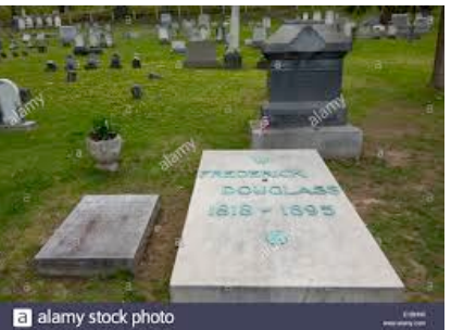
Mt. Hope Cemetery, Rochester

Leader: We adore You, O Christ, and we praise You, People: Because by your Death and Resurrection You have saved us.